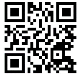
Scan to learn more about Misty Copeland