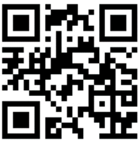
Scan to learn more about Jackson 5

February is dedicated as Black History Month, honoring the triumphs and struggles of African Americans throughout U.S. history. As a culminating project, Red Bank students participated in an African American Gallery Walk. There were 15 different QR codes posted around the school. Students walked around the school with their class and used their Chromebooks to access tidbits of information about African Americans who have made some amazing contributions to our American society in the areas of Art, Dance, Music, or Sports. It was an enjoyable way for our community to move around, learn, and talk about people who have shaped our nation.